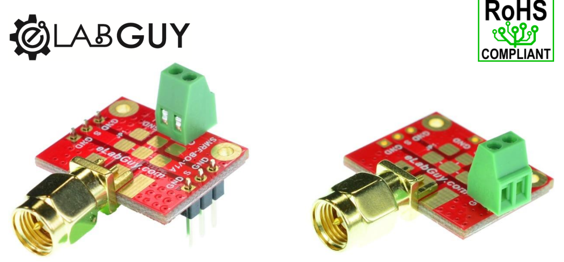
Figure 3: SMA-M-BO-V1A Various connections